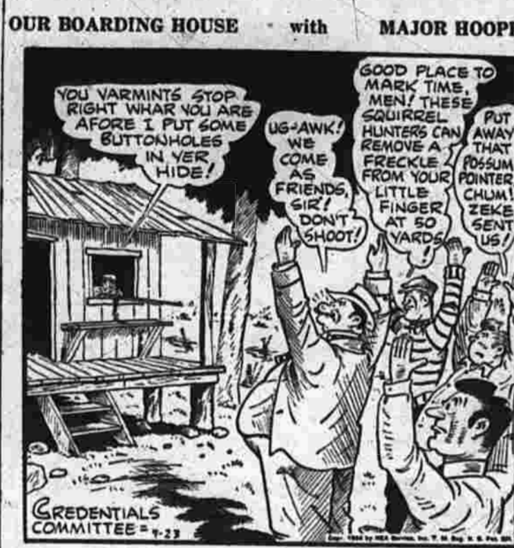
with MAJOR HOOPLE