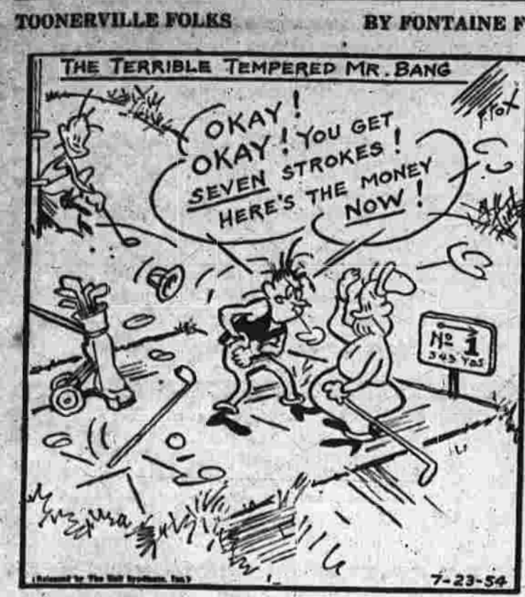
BY FONTAINE FOX